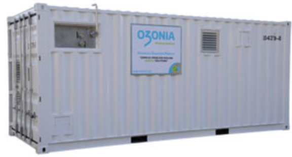
Fully integrated AOP Pilot Plant in standard 20' shipping container.

This secondary oxidant can cause the oxidation of most organic compounds until they are fully mineralized as carbon dioxide and water. The hydroxyl radical has a much higher oxidation potential than ozone or hydrogen peroxide and usually reacts at least one million times faster, thus leading to a smaller contact time and footprint.